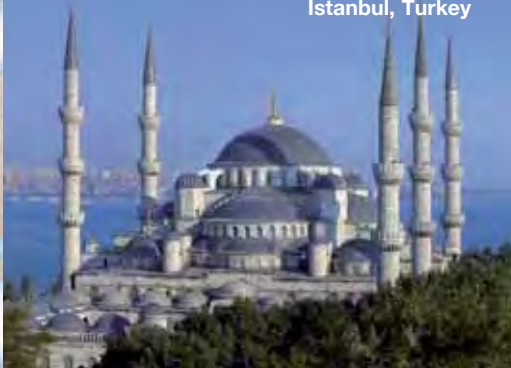
Blue Mosque Istanbul, Turkey