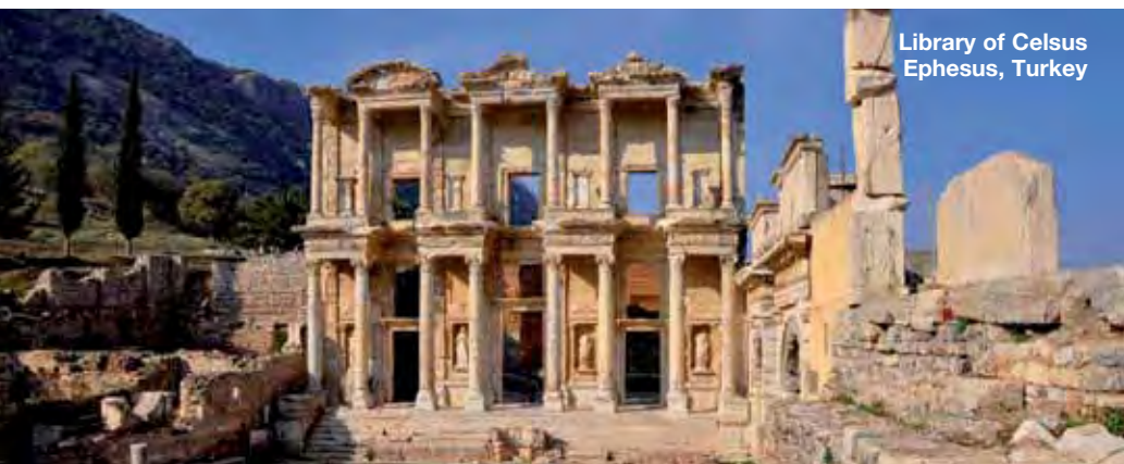
Library of Celsus Ephesus, Turkey