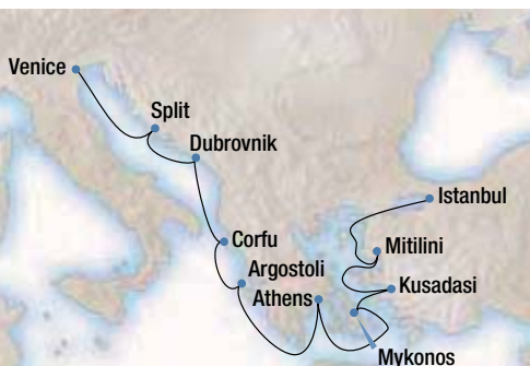
This map represents approximate locations.

Oceania Cruises may modify the cruise itinerary up to and during the voyage.