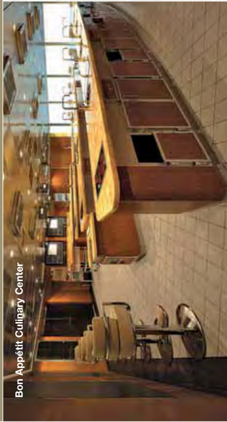
Bon Appétit Culinary Center

2-FOR-1 CRUISE FARES WITH FREE AIRFARE IF BOOKED BY MAY 23, 2011