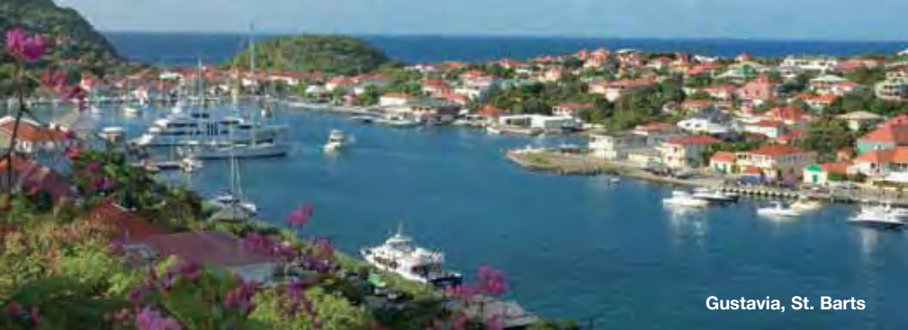
Gustavia, St. Barts