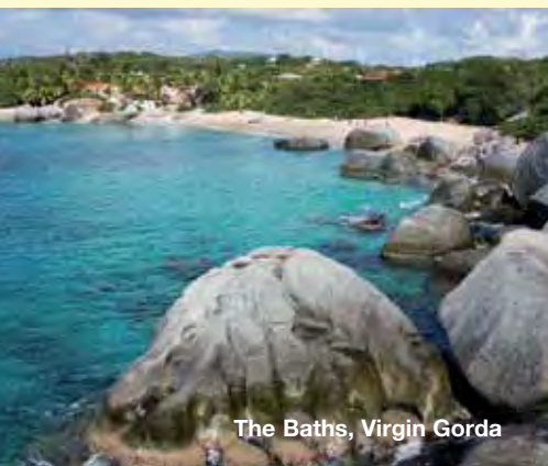
The Baths, Virgin Gorda

Go Next will offer a unique collection of Oceania Cruises shore excursions; available for purchase approximately 4 months prior to departure.