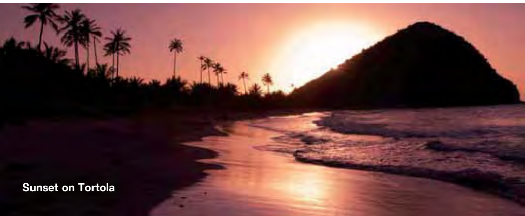
Sunset on Tortola

Call the Alumni Association at (740) 593-4300 or Go Next at (800) 842-9023