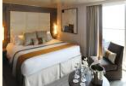
Stateroom with balcony

Ninety-five percent of the large, deluxe, air-conditioned, outside Staterooms and Suites (from 200 to 484 square feet) feature private balconies. Most accommodations have two twin beds that convert to one queen-size bed; each has a private bathroom with shower and the luxurious amenities of a fine hotel including: individual climate control, satellite flatscreen television, wireless Internet access, safe, minibar, full-length closet, writing desk/dressing table and plush robes.