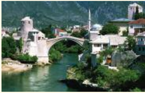
Mostar's restored 16 th -century Ottoman Stari Most Bridge connects Bosnia with Herzegovina.