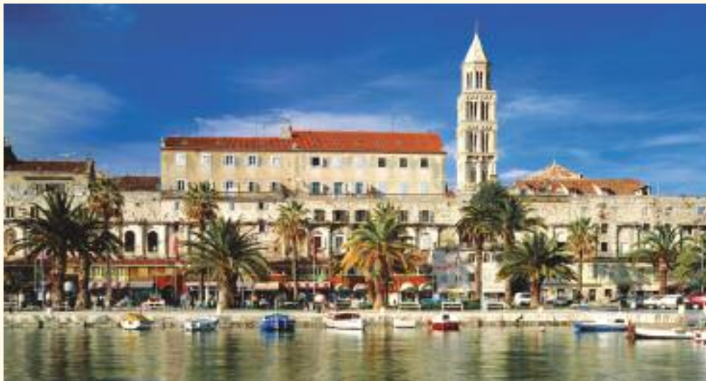
Seventeen centuries ago, Roman galleons anchored in the scenic harbor of Split and began construction of Roman Emperor Diocletian's Palace. Inset Above: Dalmatia's Coat of Arms originated in the 14th century.