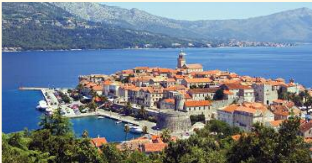
Explore the finely preserved medieval port of Korčula, encircled by its original 13th-century walls and impressive Venetian-built bastions and towers.

Since the fourth century B.C., Sicilians, Romans, Byzantines, Croats and Venetians have all left their mark on Hvar's history and architecture. The 15th-century Franciscan Monastery and the nearby Church of Our Lady of Charity house artwork showcasing the city's dual Slavic and Italian heritages. And, within the Old Town see the impressive landmarks including the Renaissance Cathedral of St. Stephen with