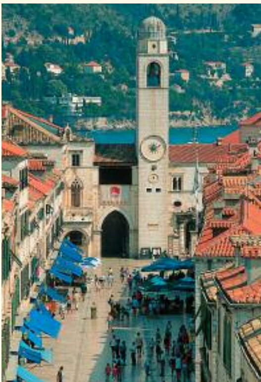
Preserving Dubrovnik's historic character has been one of the world's most comprehensive restoration projects.

Scheduled guest speakers may be altered due to circumstances beyond our control. See Terms and Conditions.