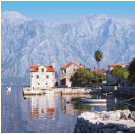
Dock in Montenegro's stunning Bay of Kotor, a natural harbor and Europe's southernmost fjord.

its Italianate bell tower, and the Benedictine Monastery, well known for its nuns' unique lace hand-crafted from agave fibers.