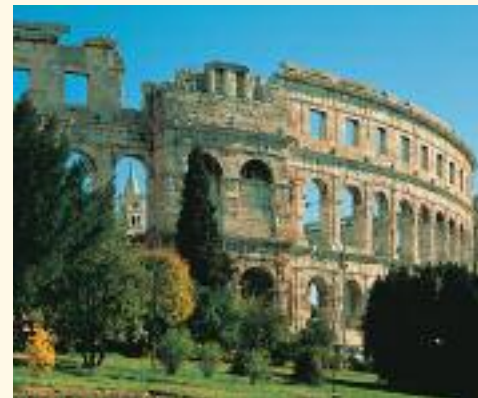
Gladiators competed before thousands in Pula's Arena, one of the greatest in the Roman World.

Diminutive houses lean together over the labyrinthine streets of Rovinj's Old Town, and traces of the Middle Ages can be seen in the ancient fortified town walls. The early 18th-century St. Euphemia Church is home to the saint's stone sarcophagus, which legend says mysteriously washed ashore in the year 800 after its disappearance from Constantinople.