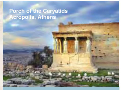
Porch of the Caryatids Acropolis, Athens