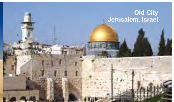
Old City Jerusalem, Israel