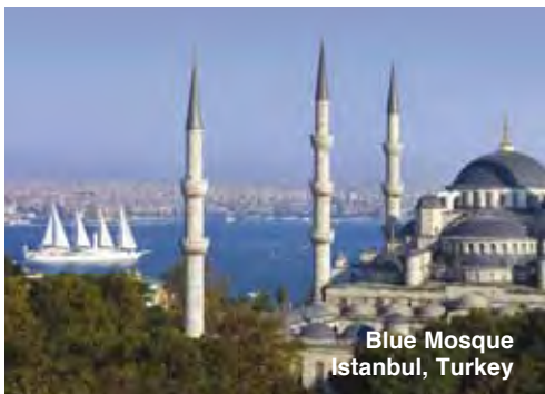
Blue Mosque Istanbul, Turkey