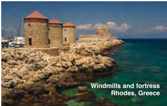
Windmills and fortress Rhodes, Greece