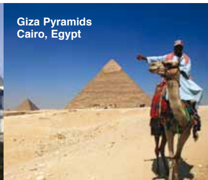
Giza Pyramids Cairo, Egypt