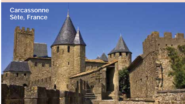
Carcassonne Sète, France