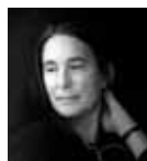
Jenny Holzer BFA '72 Hoosick Falls, NY