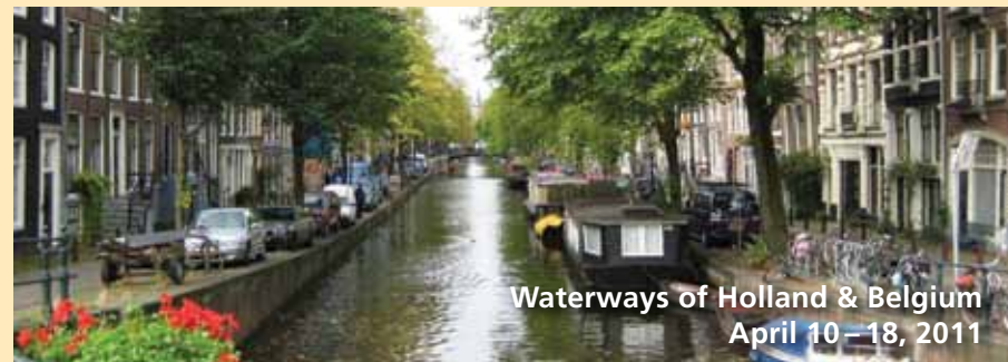
Waterways of Holland & Belgium April 10–18, 2011