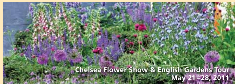
Chelsea Flower Show & English Gardens Tour May 21–28, 2011