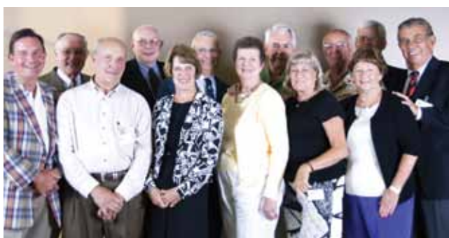
Class of 1960 graduates reunite, rekindle friendships and celebrate their OHIO bond.

The 2011 Alumni College and Golden Weekend on July 14-17, 2011, will honor the class of 1961. We encourage alumni from 1960 and beyond to begin attending as an annual tradition.