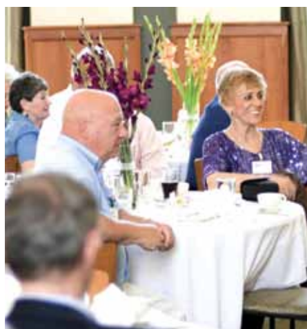
Visit www.ohioalumni.org and click on Photo Albums to view more pictures of the weekend.