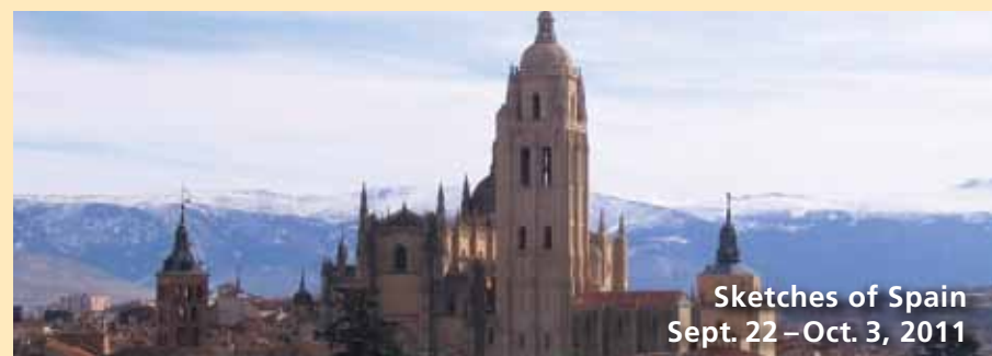
Sketches of Spain Sept. 22–Oct. 3, 2011